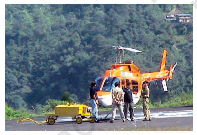
Why is air travel prefered in the north-eastern states?

The air travel, today, is the fastest, most comfortable and prestigious mode of transport.