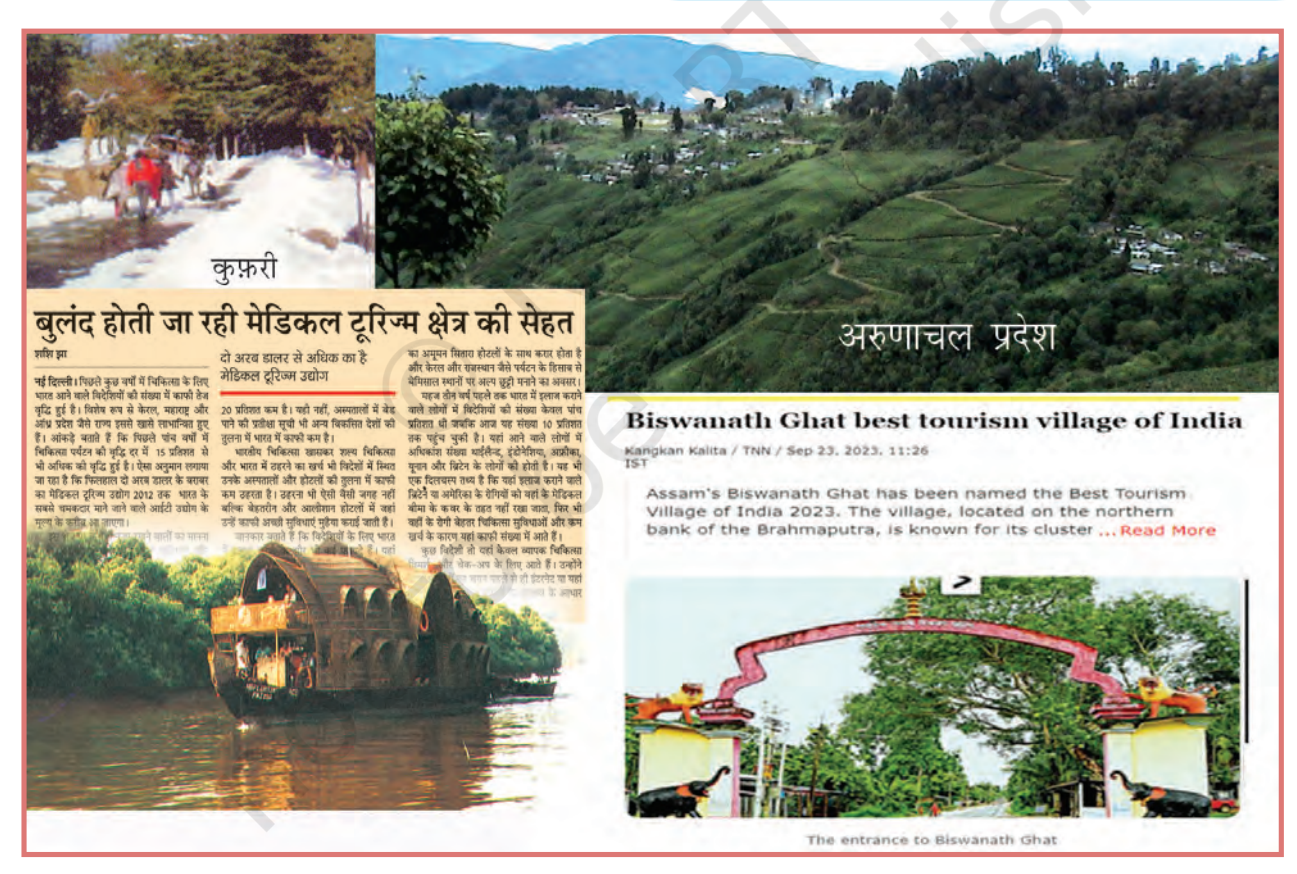
Prepare a project on the heritage tourism in India.

*Source: Annual Report 2016–17, Ministry of Commerce and Industry, Government of India.