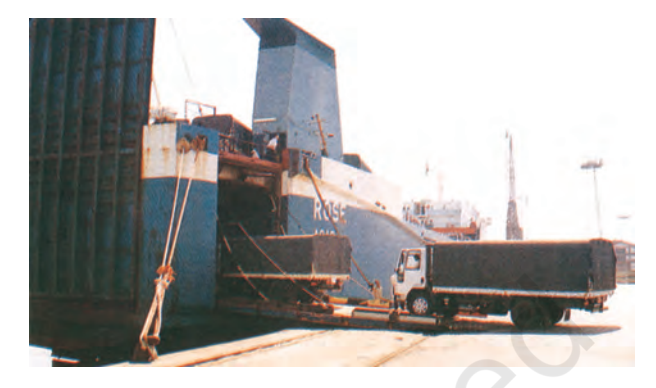
Fig. 7.6: Trucks being driven into the vessel at Mumbai port

Deendayal Port, is a tidal port. It caters to the convenient handling of exports and imports of highly productive granary and industrial belt stretching across UT of Jammu and Kashmir, and the states of Himachal Pradesh, Punjab, Haryana, Rajasthan and Gujarat.