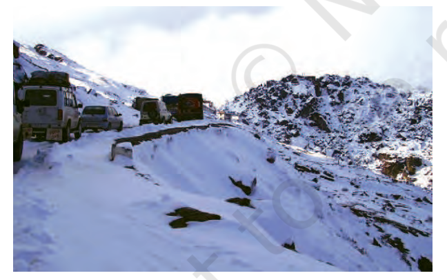
Fig. 7.4: Traffic on north-eastern border road (Arunachal Pradesh)

Roads can also be classified on the basis of the type of material used for their construction such as metalled and unmetalled roads. Metalled roads may be made of cement, concrete or even bitumen of coal, therefore, these are all weather roads. Unmetalled roads go out of use in the rainy season.