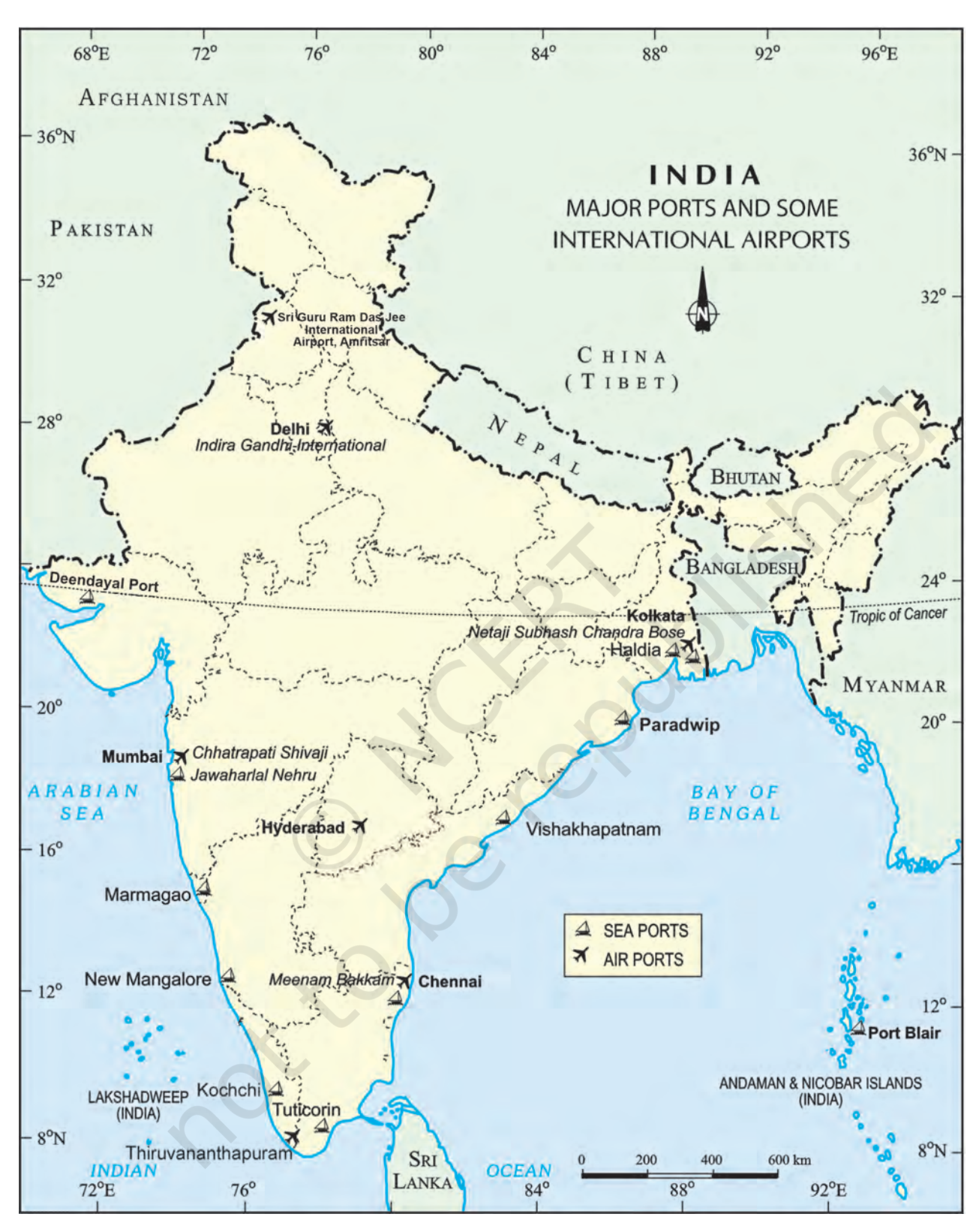
India: Major Ports and Some International Airports