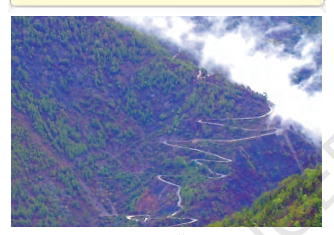
Fig. 7.3: Hilly Tracts