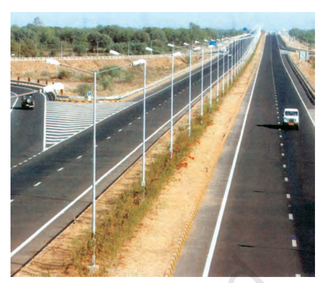
Fig. 7.2: Ahmedabad- Vadodara Expressway